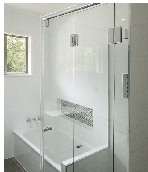
Hybrid Bifold Screen.