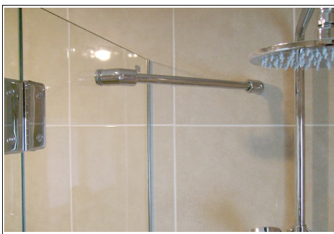
Detail of solid brass shower-to-wall bracing.