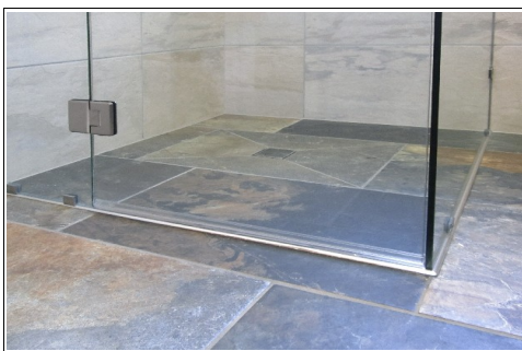
Custom D-mold threshold with floor clamps.