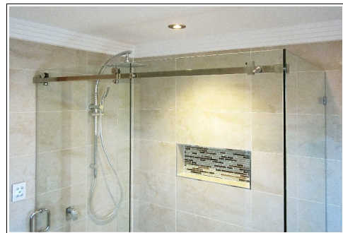
Serenity Frameless Sliding Shower Screen.

We also offer the Serenity frameless sliding system, as well as a hybrid bifold which utilizes the best of two systems to create a unique and extremely strong bifold folding shower door.