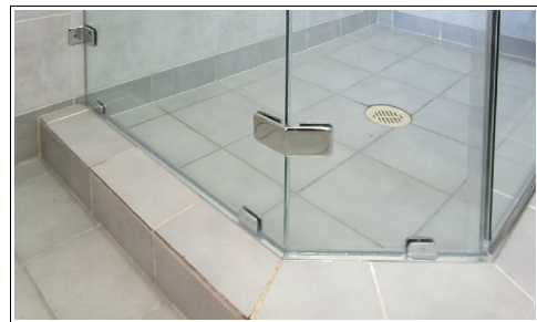
10mm frameless screen, designed to suit an existing irregular hob.

Tabicat specialize in 8-10mm frameless screens; however, shower screens with header systems are also available in 6mm glass. Screens can be designed for 180° front-only, 90° or 135° showers, bath showers, or even showers with irregular angles.